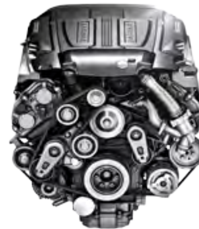
3.0-litre V6 supercharged petrol engine

The 14MY XJ has a secondary battery fitted specifically for engine re-starting, meaning that all the normal car systems – such as the entertainment system, the ventilation and lights – continue to receive power from the standard car battery and are unaffected by the re-start. In addition, a sophisticated control system ensures that the Stop/Start operation only occurs when the car does not require the engine for other functions.