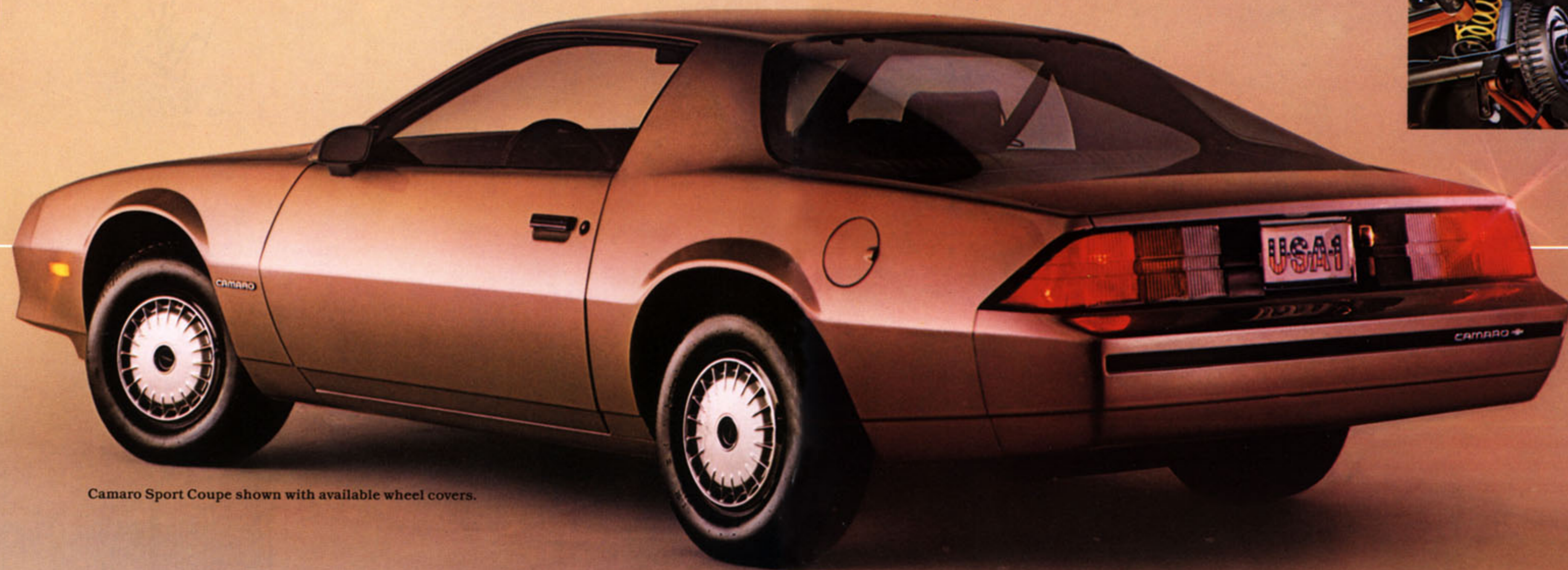
Camaro Sport Coupe shown with available wheel covers.

1 Charcoal/Burnt Orange. 2 Available after Announcement.