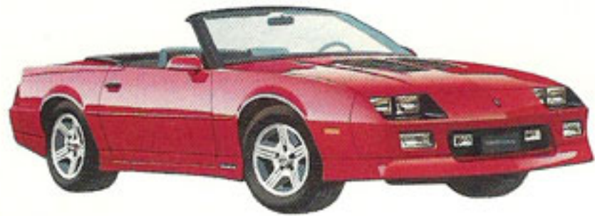
Camaro IROC-Z Convertible.