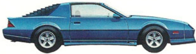
Camaro RS Coupe with optional rear window louvers.