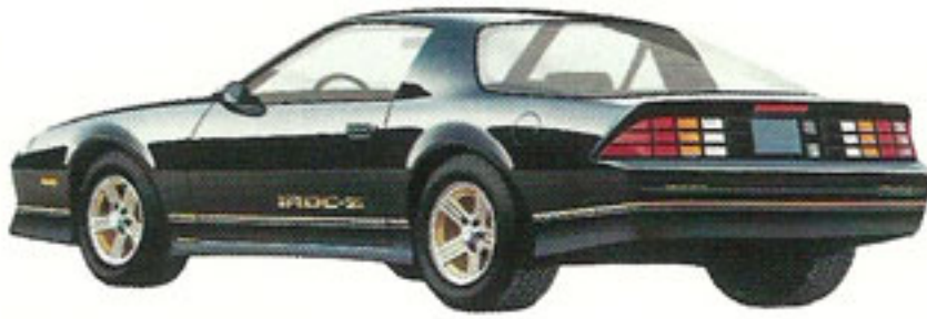
Camaro IROC-Z Coupe.