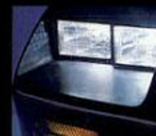
High/low halogen headlamps are available.