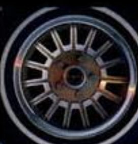
Optional aluminum-finned wheel (gold on Berlinetta, argent on Sport Coupe).