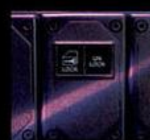
Optional power door locks.