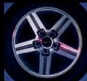
IROC-Z 16" standard aluminum wheel.