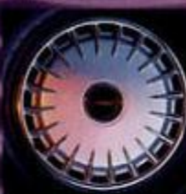
Optional Sport Coupe cover.