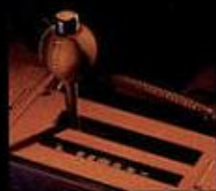
Four-speed overdrive automatic transmission is available.