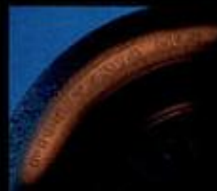
All-season M + S-rated tires are standard on Berlinetta/Sport Coupe.

*NA IROC-Z †Gray cloth seat and door insert.