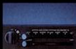
Optional air conditioning.