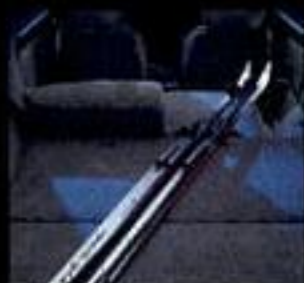
Split-folding rear seat-backs are available.