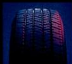
P215/65R-15 Eagle GT's are standard on Z28.