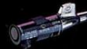
Optional electronic speed control includes resume and speed adjustment features.