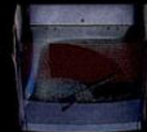
Rear window wiper/washer and electric defogger are welcome options in foul weather.