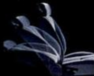
Front seats recline.