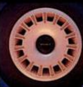
Standard Berlinetta wheel cover.