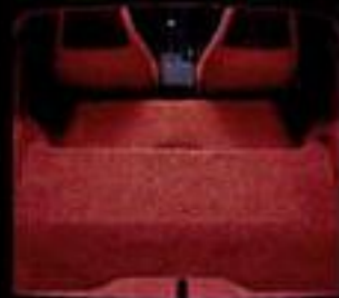
Rear seat-back folds flat for 31.0 cubic feet of cargo space.