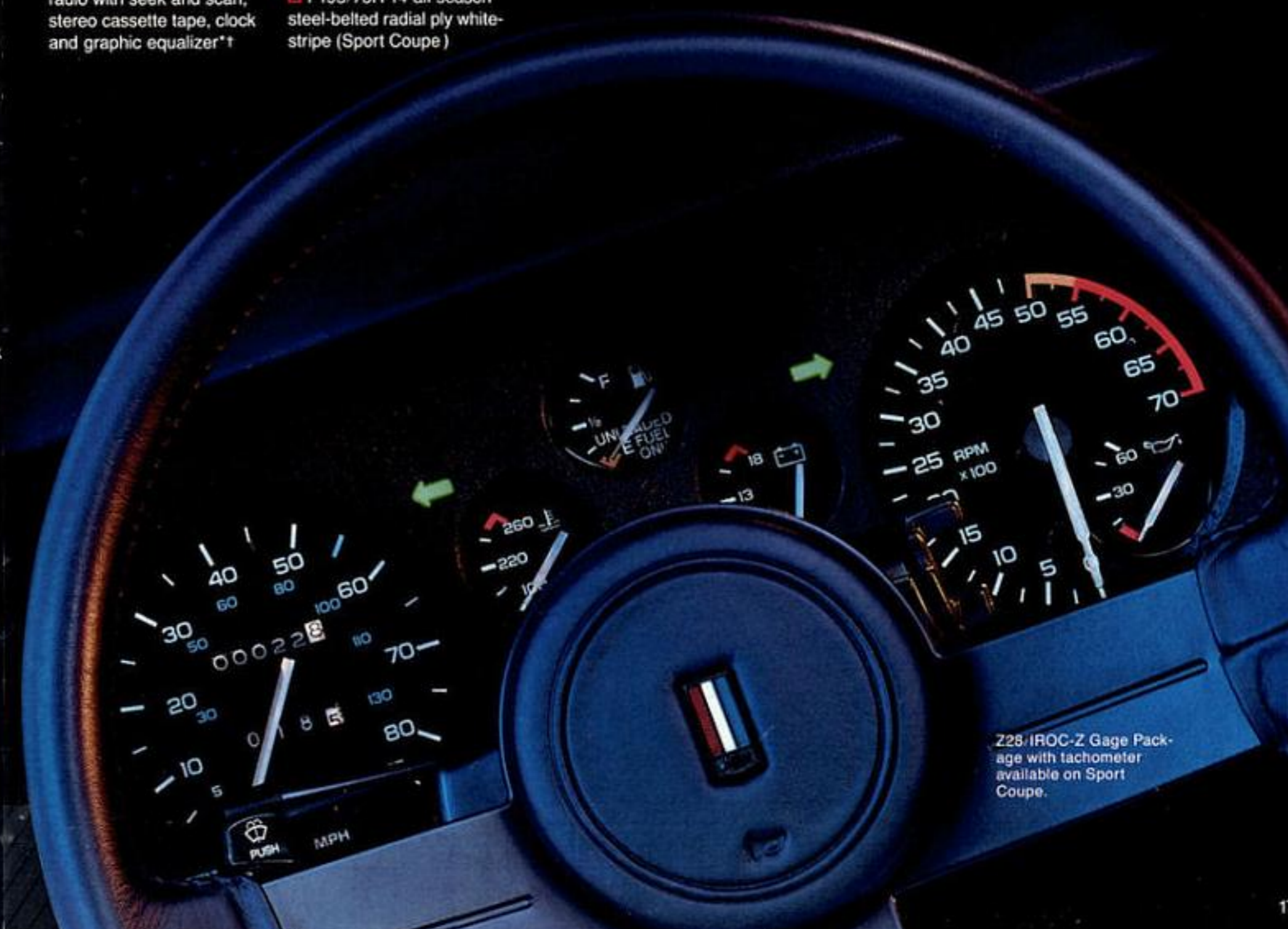
Z28 IROC-Z Gage Package with tachometer available on Sport Coupe.

An option that offers service protection in addition to that provided by GM's new-vehicle limited warranty. Coverage available only in the U.S. and Canada. Ask your dealer about it.