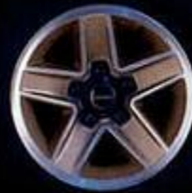
Z28 standard aluminum wheel.