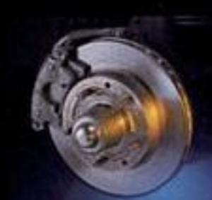
Power 4-wheel disc brakes available.