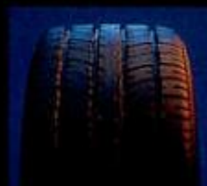
IROC-Z features P245/50VR-16 radials.