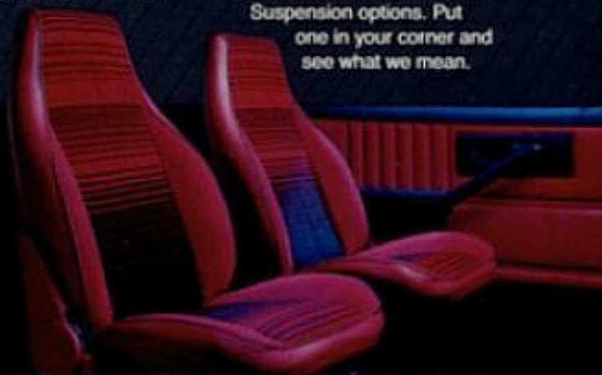
Camaro Sport Coupe features standard reclining bucket seats in your choice of new vinyl or optional cloth.

one in your corner and see what we mean.