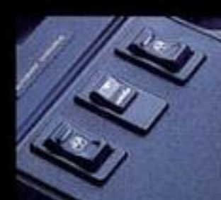
Optional power windows.