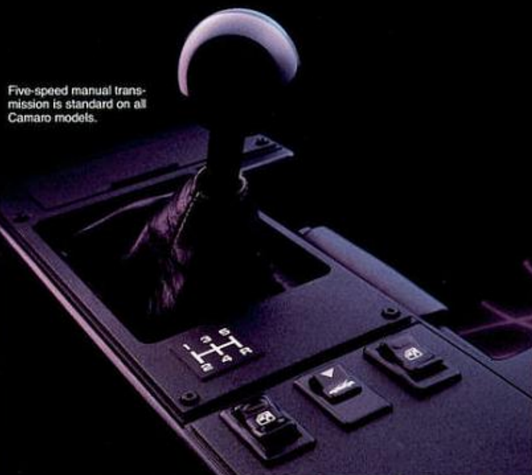
Five-speed manual transmission is standard on all Camaro models.