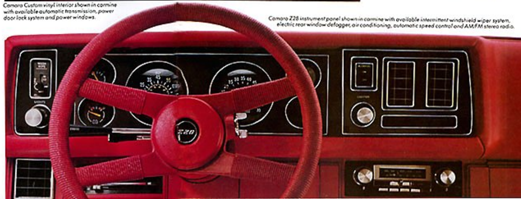
Camaro Z28 instrument panel shown in camino with available intermittent windshield wiper system, electric rear window defogger, air conditioning, automatic speed control and AM/FM stereo radio.