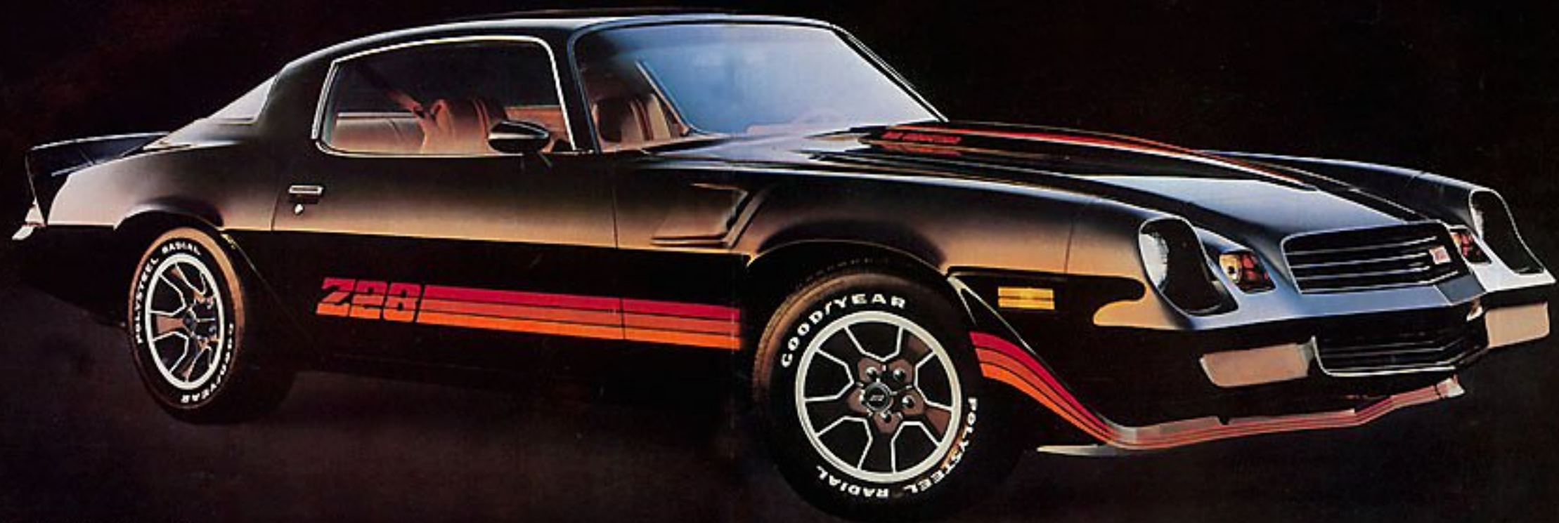
Camaro Z28 shown in black with available aluminum wheels. Custom interior and roof drip moldings.