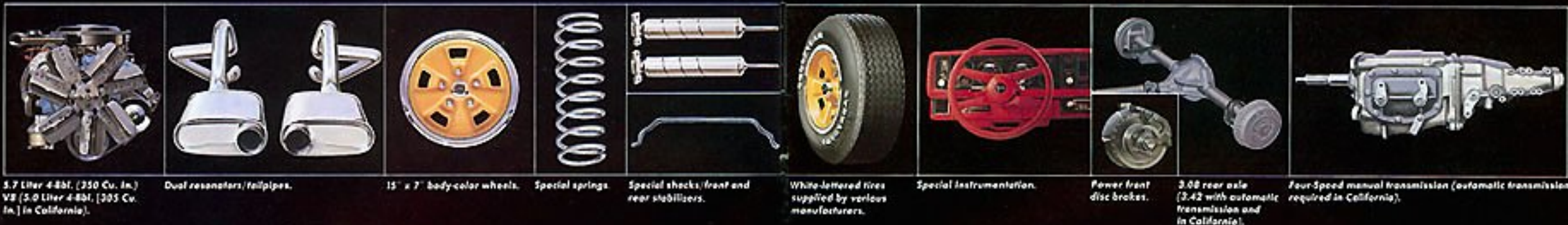
5.7 Liter 4-861, (350 Cu. In.) V8 (5.0 Liter 4-861, [305 Cu. In.] in California).