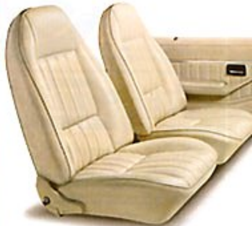
Camaro standard vinyl interior shown in oyster.

The sleek styling and lush good looks of a Camaro continue once you open the door. You know you're not in any ordinary car. Comforted, full foam front bucket seats comfortably settle you inside the roomy cockpit-style interior. The instrument panel presents you with impressive, easy-to-see performance readouts. Added luxury makes its presence felt with a color-keyed center floor console, wall-to-wall carpeting, tailored upholstery and artfully blended color schemes. But you're in the driver's seat—choose your own colors and materials. So go ahead—design your Camaro to suit your personal touch.