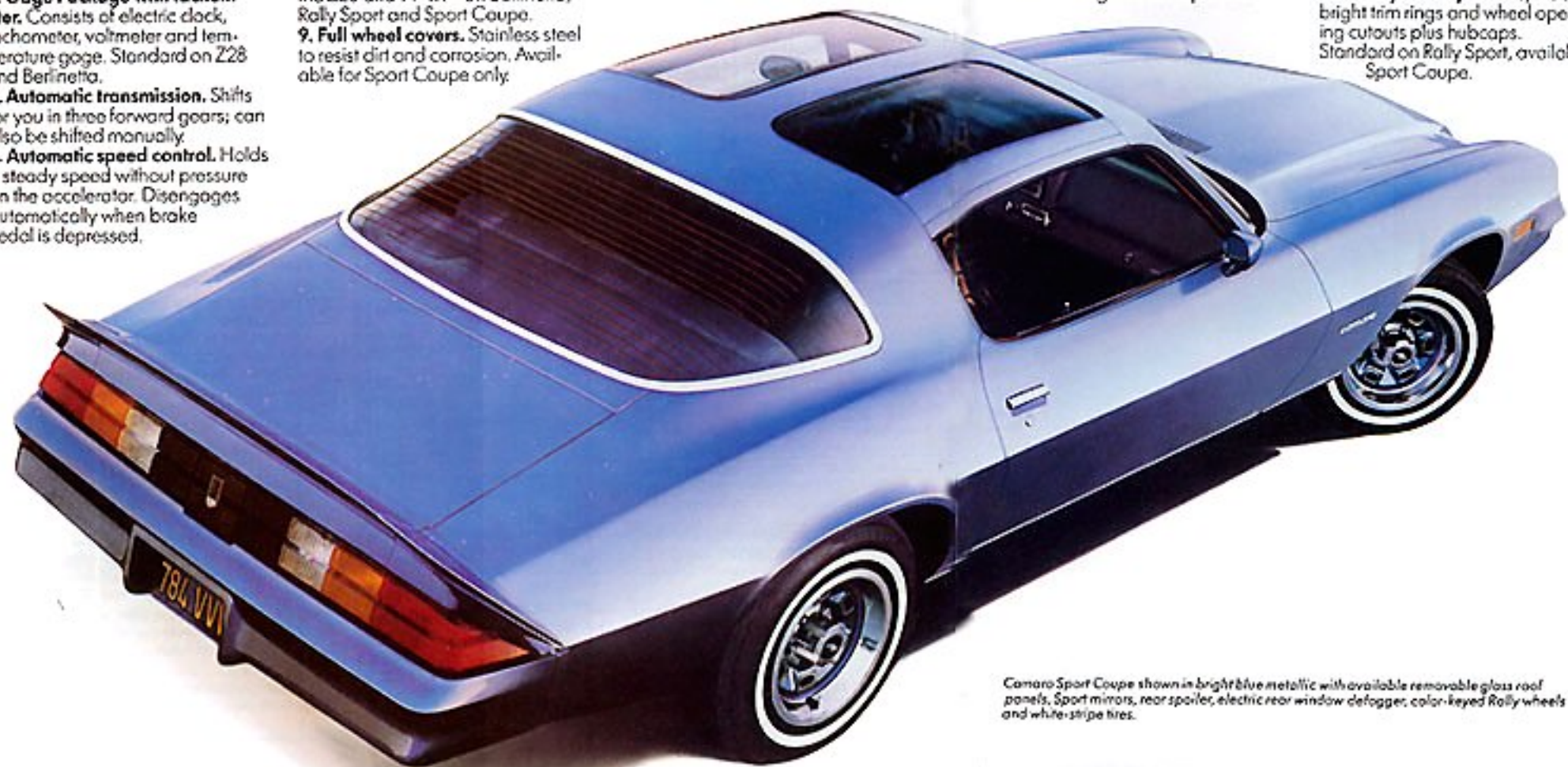
Camaro Sport Coupe shown in bright blue metallic with available removable glass roof panels, Sport mirrors, rear spoiler, electric rear window defogger, color-keyed Rally wheels and white-stripe tires.

With respect to extra cost optional equipment, make certain you specify the type of equipment you desire on your vehicle when ordering it from your dealer. Some options may be unavailable when your car is built. Your dealer receives advice regarding current availability of options. You may ask the dealer for this information. GM also requests the dealer to advise you if an option you ordered is unavailable. We suggest you verify that your car includes the optional equipment you ordered or, if there are changes, that they are acceptable to you.