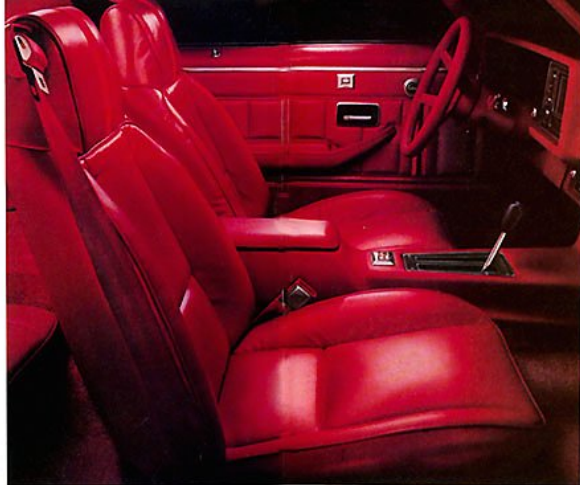
Camaro Custom vinyl interior shown in camino with available automatic transmission, power door lock system and power windows.