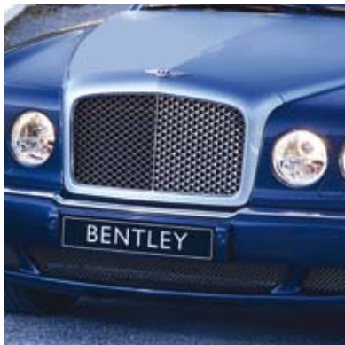
DUOTONE PAINT COMBINATION