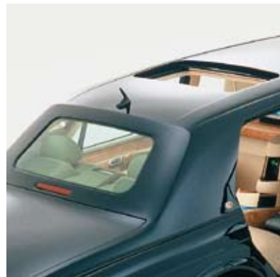
REAR COMPARTMENT ELECTRIC SUNROOF* (*RL ONLY)