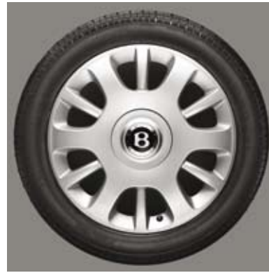
19"x8| 12-SPOKE ALUMINIUM ALLOY