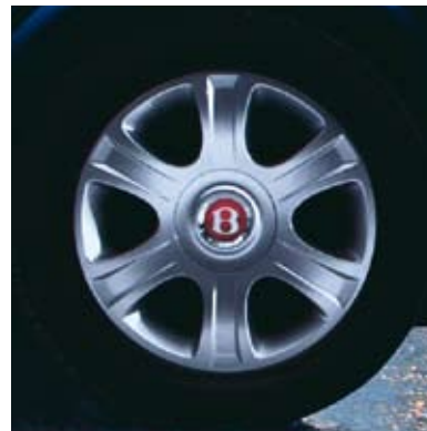
18"x8| 6-SPOKE CHROME PLATED ALUMINIUM ALLOY