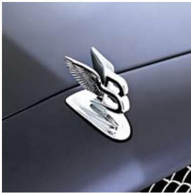
RETRACTABLE FLYING 'B' RADIATOR MASCOT