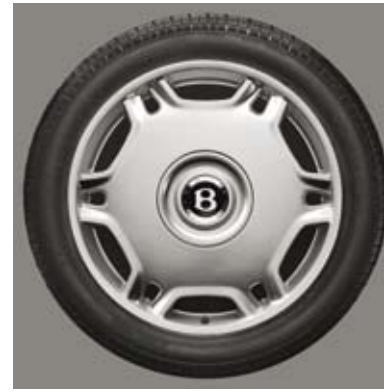
19"x8| 6 TWIN-SPOKE DISC ALUMINIUM ALLOY