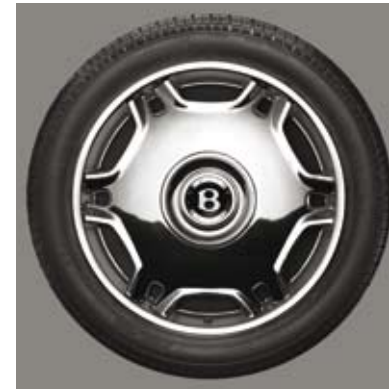
19"x8| 6 TWIN-SPOKE DISC ALUMINIUM ALLOY (CHROMED)