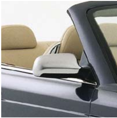
CHROME MIRROR CAPS