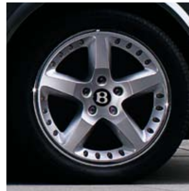
19"x8| 5-SPOKE 2-PIECE SPORTS 'BLADE' ALUMINIUM ALLOY (PAINTED)