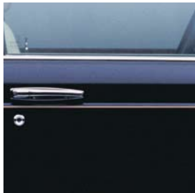
FINE LINES TO EXTERIOR BODYWORK