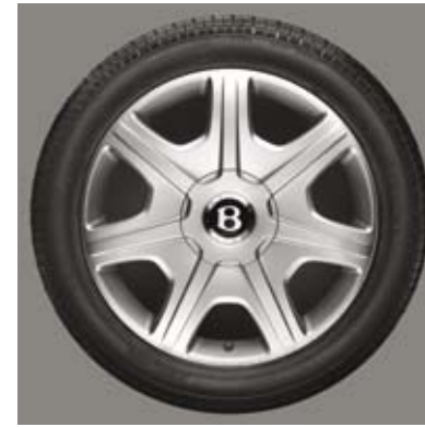
19"x8| 7-SPOKE ALUMINIUM ALLOY