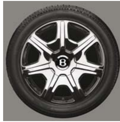
19"x8| 7-SPOKE CHROME PLATED ALUMINIUM ALLOY