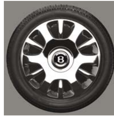
19"x8| 12-SPOKE CHROME PLATED ALUMINIUM ALLOY