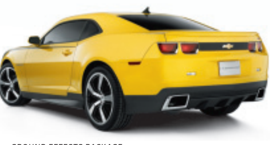
GROUND EFFECTS PACKAGE