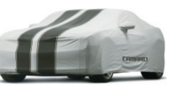
CUSTOM CAMARO CAR COVER