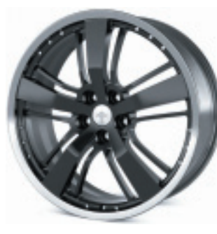
21-IN. BLACK PAINTED WHEEL