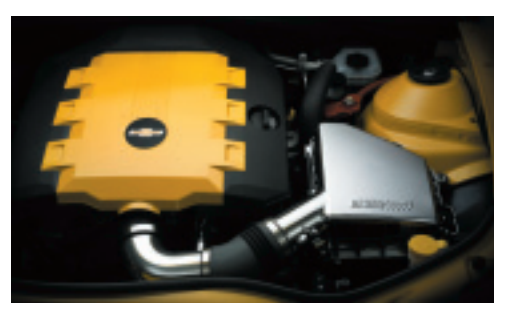
BODY-COLOURED ENGINE COVER WITH PERFORMANCE INTAKE