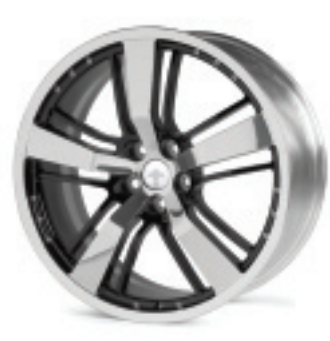
21-IN. MACHINED-ALUMINUM WHEEL WITH BLACK ACCENTS