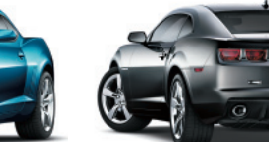
GAZ - Summit White†