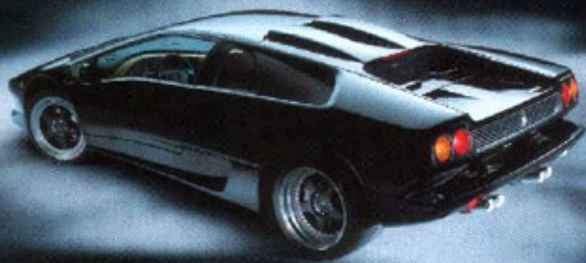
DIABLO SV WITH TWO-WHEEL DRIVE TRANSMISSION

DIABLO ROADSTER, CON TETTuccio RIGIDO E TRAZIONE INTEGRALE PERMANENTE