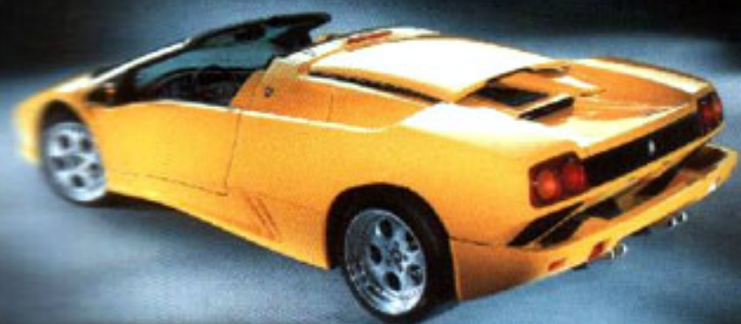
DIABLO ROADSTER, WITH HARDTOP AND PERMANENT FOUR-WHEEL DRIVE TRANSMISSION

DIABLO ROADSTER, CON TETTuccio RIGIDO E TRAZIONE INTEGRALE PERMANENTE